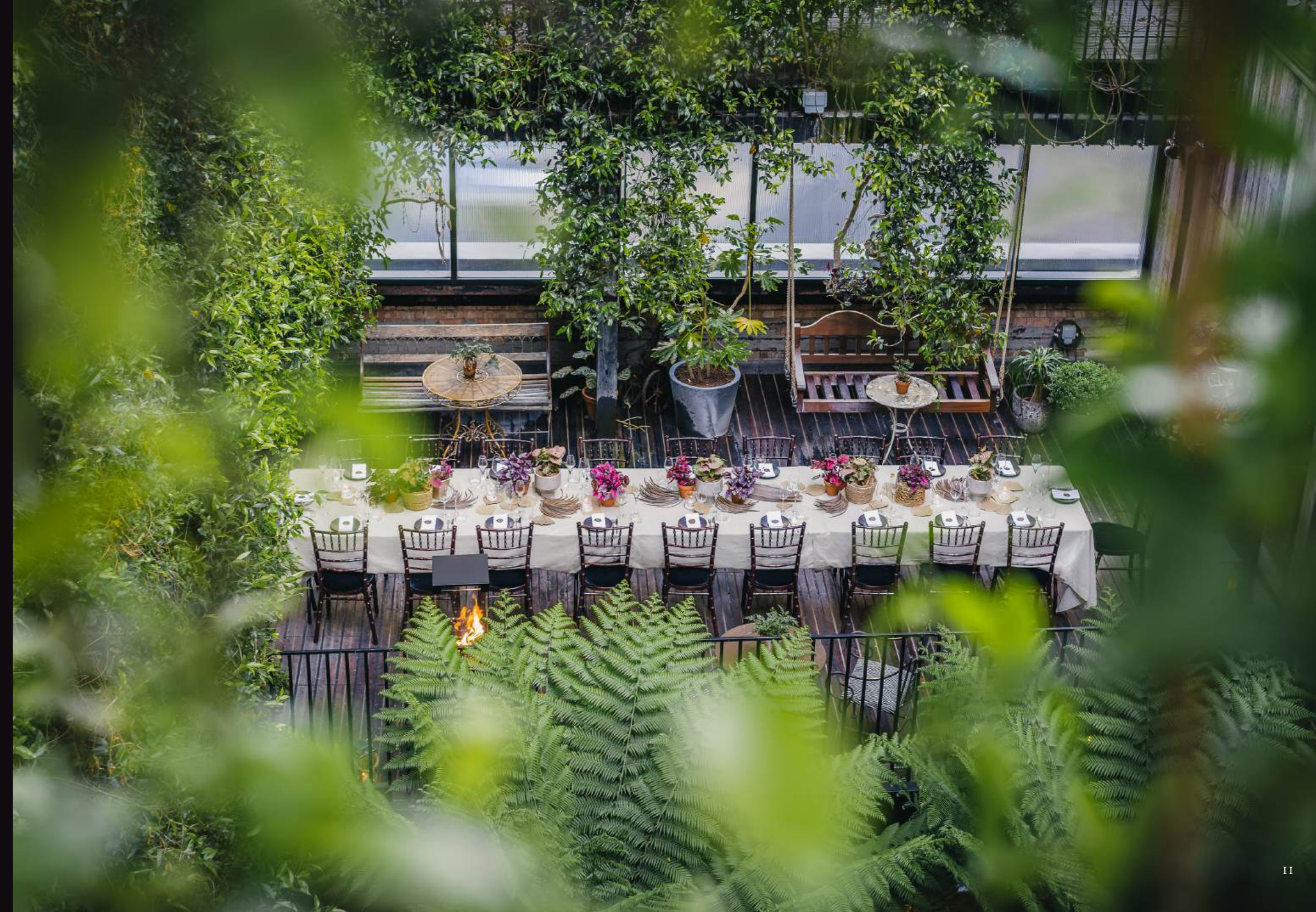
Photo of Jurema South: Available May-September, Monday to Thursday.