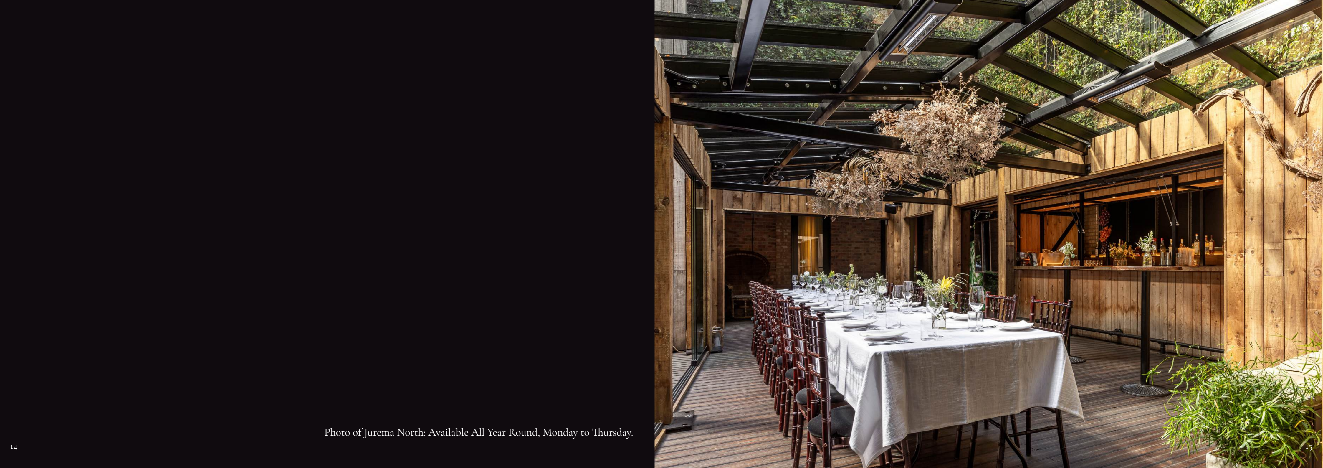
Photo of Jurema North: Available All Year Round, Monday to Thursday.