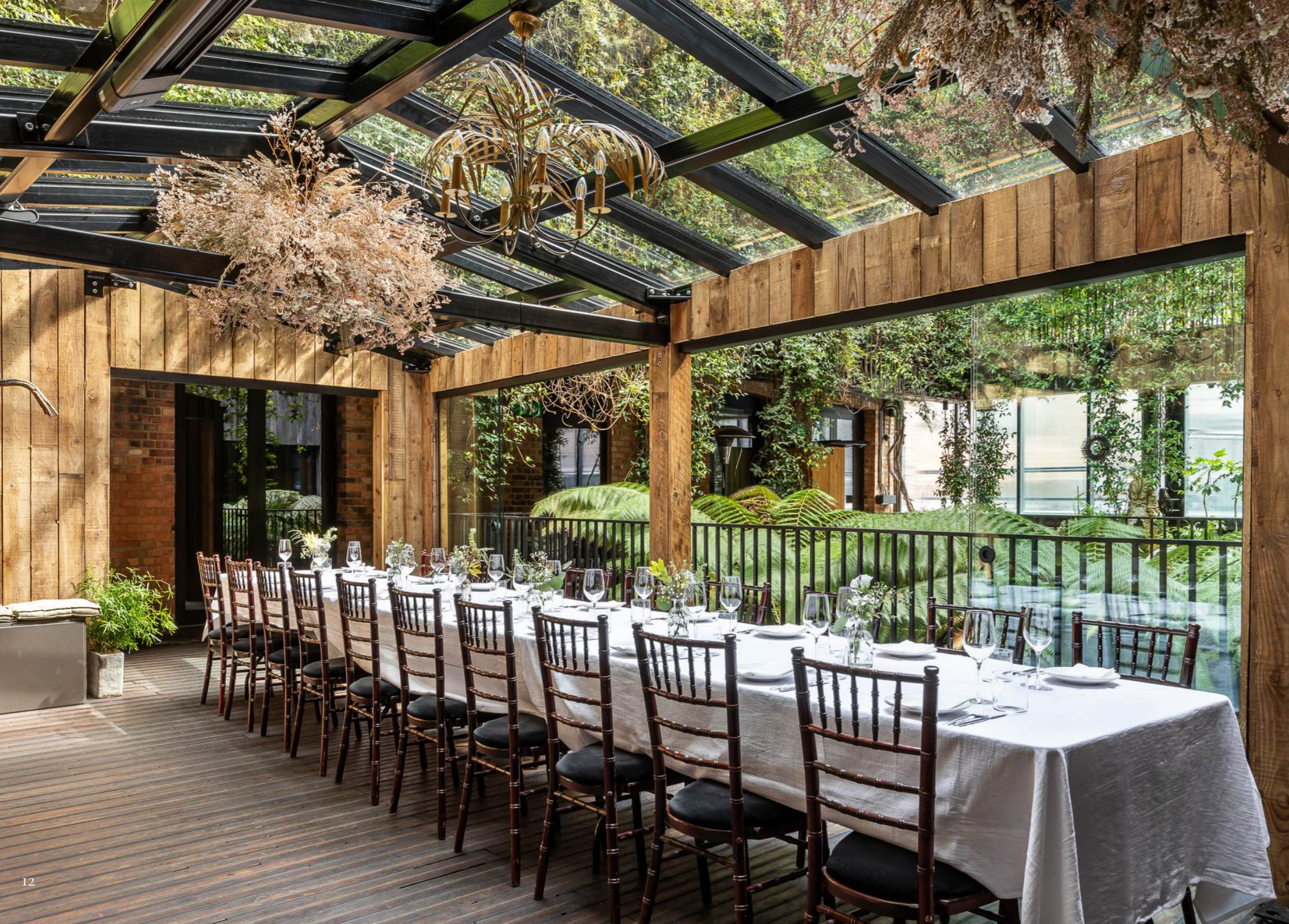
Photo of Jurema North: Available All Year Round, Monday to Thursday.